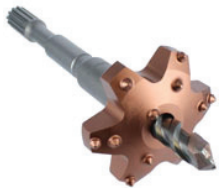
Countersink Drill Bit