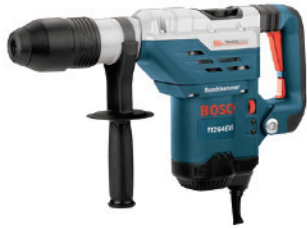
Bosch Hammer Drill